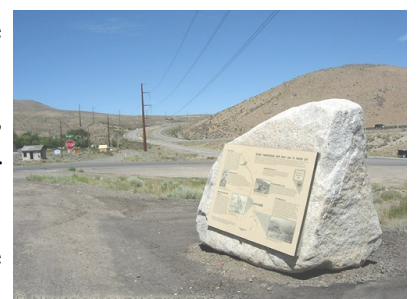
Along N. Virginia Street, 8 miles north of Reno

The historic road corridors from the Truckee Meadows northwestward into the Honey Lake area contain intertwined routes following the course of valleys, parts of an emigrant trail cutoff, toll roads, county roads, and parallel routes developed to bypass blockages such as mudholes. Construction of the paved precursor to U.S. 395 and freeway construction along this corridor have erased much of the earlier road system, cutting it into isolated segments. The road is associated with the history of transportation in Nevada, reflecting the process of road improvement and economic and demographic change.