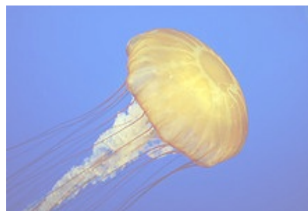
Pacific Sea Nettle

FAST OPEN PAIRS. . . . . 10 a.m. & 1 p.m. STRATIFLIGHTED SWISS TEAMS... 10 a.m. & TBA (20 VP scale; out by 6 p.m.! ) 299ER SINGLE-SESSION SWISS TEAMS... 10 a.m. (20 VP scale) 299ER ONE-SESSION SWISS TEAMS. . . . . 2 p.m. (20 VP scale)