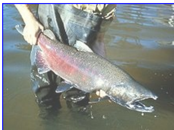
Chinook or King Salmon

2-SESSION SWISS TEAMS (stratified; Sat am too). 9 a.m. MORNING SIDE GAME SERIES (stratified) . . . . . 9 a.m. 299ER SINGLE-SESSION PAIRS (stratified). . . . . 9 a.m. Louis & Clark Bracketed KO TEAMS (3rd session) . . 1 p.m. SAND DOLLAR Bracketed KO TEAMS (1st session). 1 p.m. OPEN PAIRS (stratified, 2 sessions). . . . . 1 & 7 p.m. RAINBOW TROUT GOLD PAIRS (750/300/0). 1 & 7 p.m. AFTERNOON SIDE GAME SERIES (stratified) . . . . 1 p.m. 99ER SINGLE-SESSION PAIRS (stratified). . . . . 1 p.m. 299ER SINGLE-SESSION PAIRS (stratified). . . . . 1 p.m. Louis & Clark Bracketed KO TEAMS (final session) . 7 p.m. SAND DOLLAR Bracketed KO TEAMS (2nd sess.).. 7 p.m. EVENING SIDE GAME SERIES (stratified). . . . . 7 p.m. SINGLE-SESSION SWISS TEAMS (stratified). . . . . 7 p.m. 99ER SINGLE-SESSION PAIRS (stratified). . . . . 7 p.m. 299ER SINGLE-SESSION PAIRS (stratified). . . . . 7 p.m.